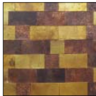
Copper & Bronze WPTRM006