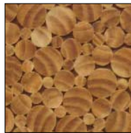
Circular Teak WPTRM009