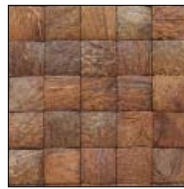
Curved Rustic Coconut WPTRM005