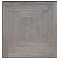
Silver Plantain Bark Relief WPTRM010