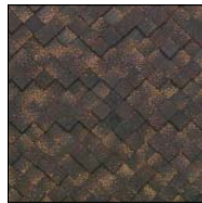
Rhombus Pointed Palm Wood Relief WPTRM007