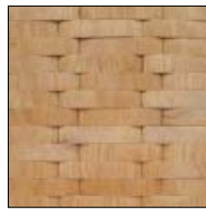
Wave Pine WPTRM003