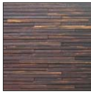
Palm Wood Relief WPTRM001

Inspired by the popular Tropical Veneer Collection, this new cost-effective product showcases handmade, organic materials in dimensional and mosaic designs. Tropical Organic Wall Mosaic is lightweight and backed on natural mesh, allowing flexibility for application on straight or curved surfaces. The interlocking system creates a seamless and exquisite effect. A fully sustainable product, every step of the manufacturing process has been considered in order to minimize impact on the environment. Please note that variations in color and texture may occur due to the nature of the material. For updates and complete collection offerings and specifications, please visit www.archsystems.com .