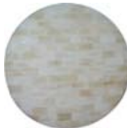
Pearlstone Token SPTBC116