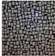
Pearlstone Inlay - Black Fill SPTBC160