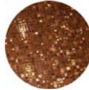
Coconut Tokens - Square SPTBC392