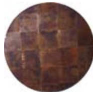
Copper - Aged SPTBC056