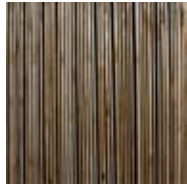
Bamboo Strips - Black Fill SPTBC212