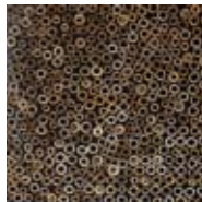
Bamboo Rings - Black Fill SPTBC393