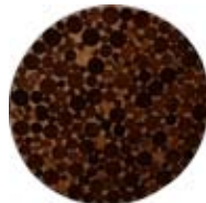
Circular Teak SPTBC386