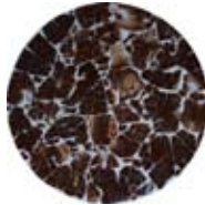
Crushed Coconut - White Fill SPTBC012